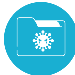
Advanced Persistent Threats (APTs)